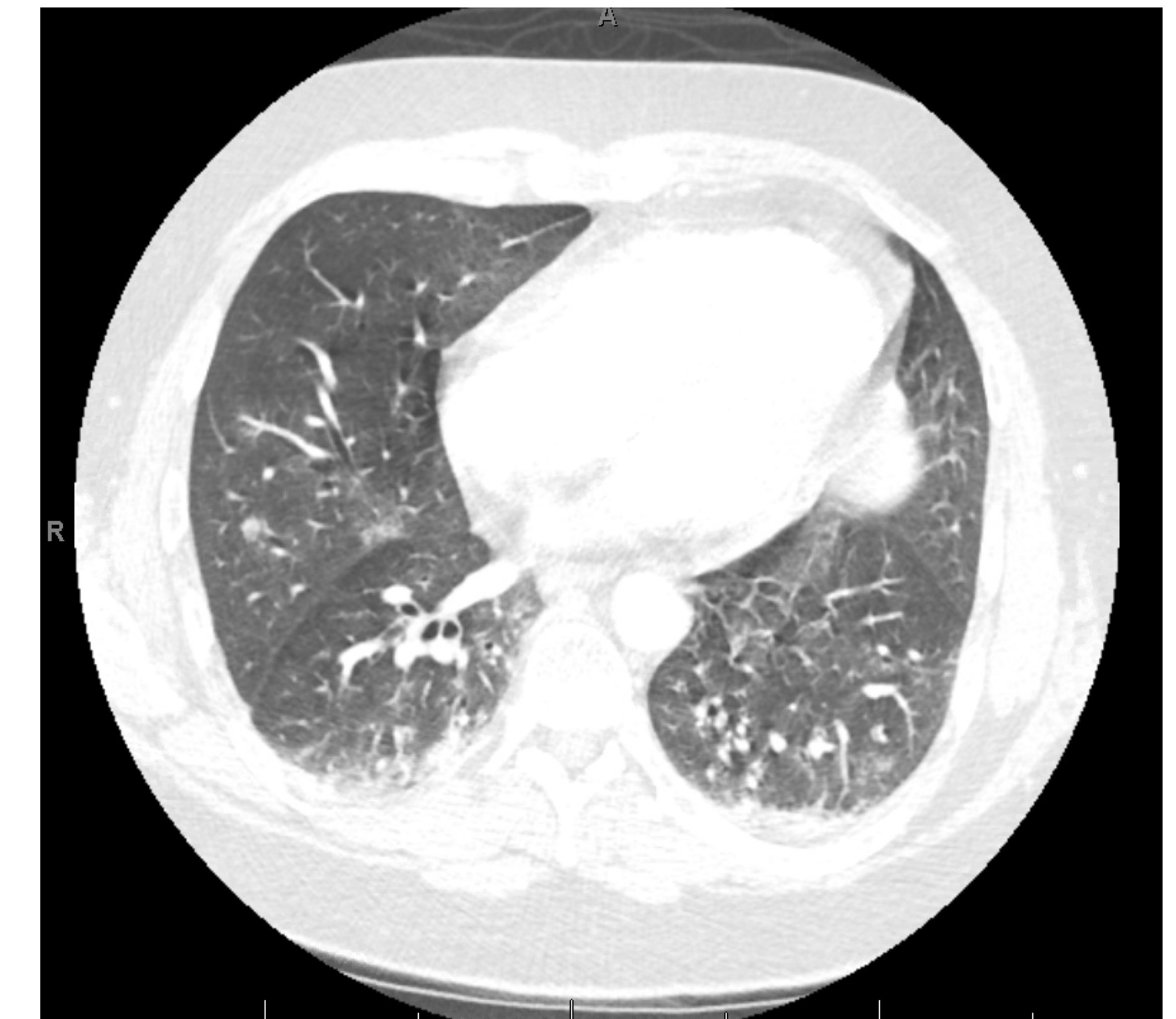
Figure 1. Bibasilar subsegmental dependent densities, scattered groundglass and alveolar nodular/interstitial densities bilaterally, several collapsed or opacified lower lobe bronchi