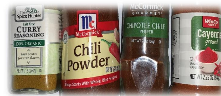
Table 1. Responses to Spices