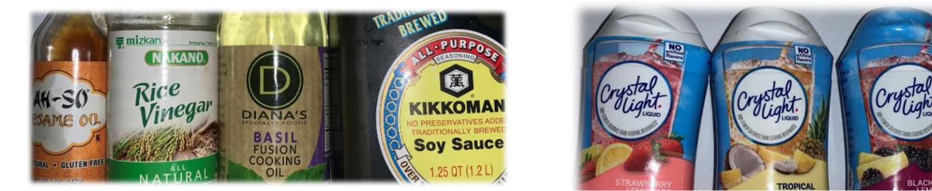
Table 2. Responses to Liquids