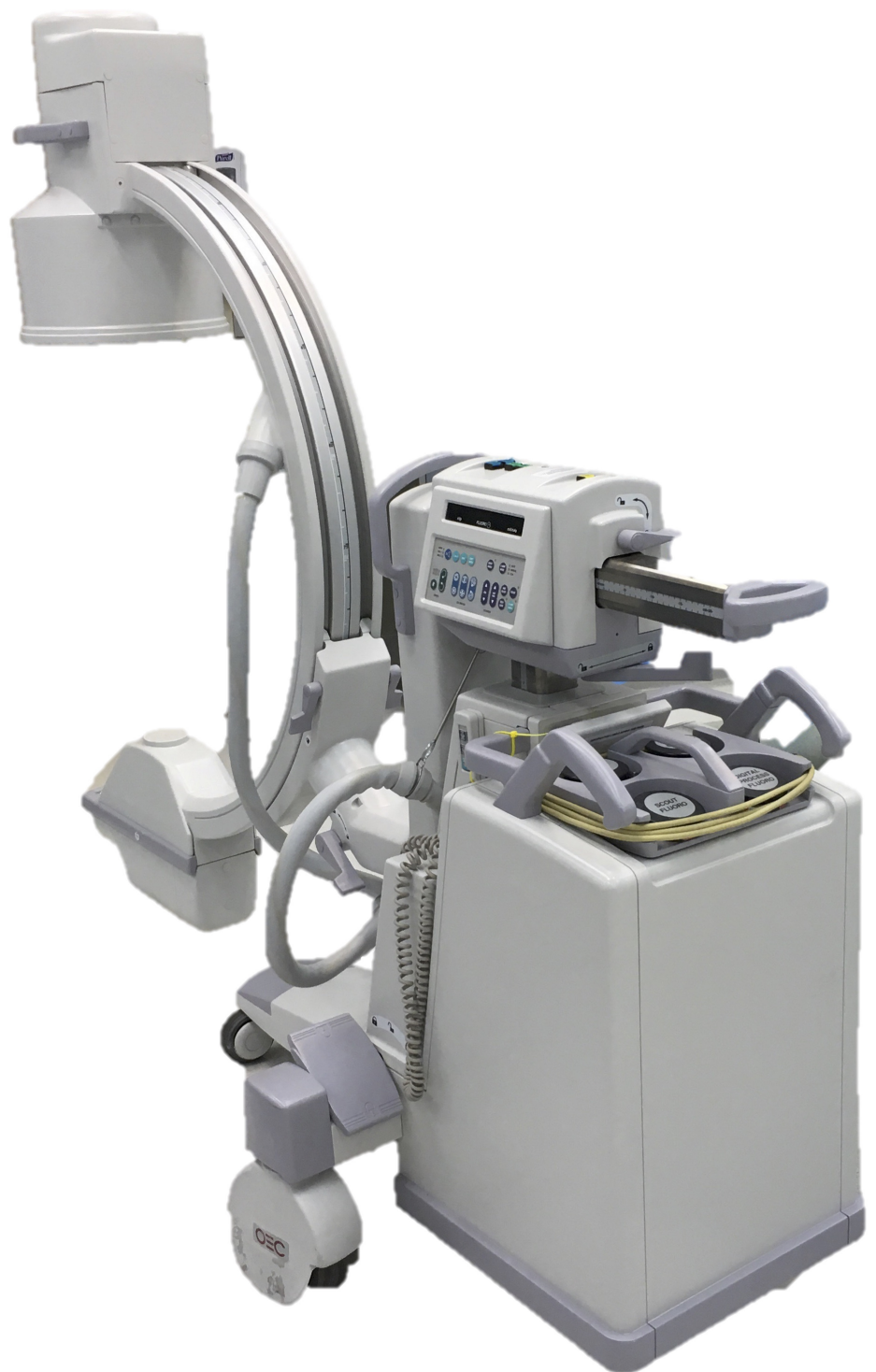
FIGURE 1: C-Arm