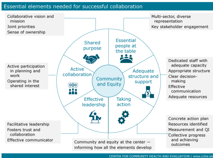
Figure 3. Essential elements needed for effective collaboration, the Hearts of Sonoma County Initiative, Sonoma County, California. Abbreviation: QI, quality improvement.

Details about the evolution of the collaborative structure and process, as well as successes, challenges, and lessons learned, were gathered through document review and interviews with 8 key participants. The data gathering was organized using a framework developed by the Center for Community Health and Evaluation (CCHE) to track key elements in coalition development (Figure 3).